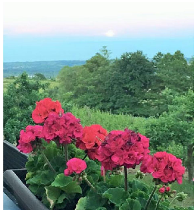
European sunset in the beautiful Rhine Valley

Enjoy our travel photos from last month's trip. Visit out photo gallery