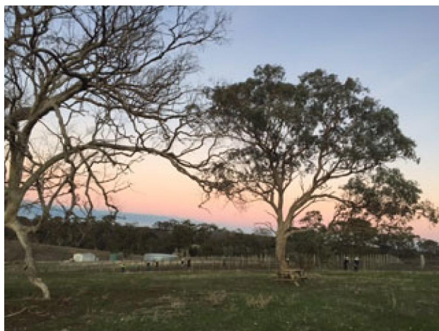
Early morning pruning

The 2015 pruning season began on 20/7. We've been very lucky with the weather and managed to prune and tie down over 30 acres of vines in less than 6 days. Only another 26 acres to go! The vines are all strong and healthy with another bumper fruit year expected. Winter maintenance in the vineyards is well underway and we will be ready for Spring and the mowing season in less than 5 weeks.